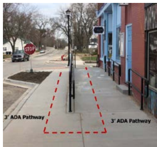
Fig. 1 Two ADA Pathways Required

Each block and each side of the street in the Central Business District (CBD) have different total widths measured from the building façade to the face of the street curb. There are areas as well where two different ADA Pathways are required to access a business and to allow access to the street crossings, which substantially reduce any effective area for merchant use of the sidewalks. See Fig. 1